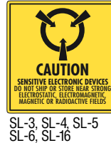
SL-3, SL-4, SL-5 SL-6, SL-16