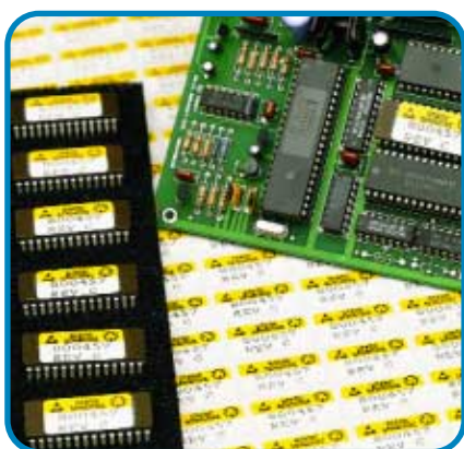
Fanfold SLDAT static awareness labels feature space for computer-printed or typewritten variable copy. Black-on-yellow labels are pre-printed with MIL 129J and EIA 471 static awareness symbols. Available in B-502 removable vinyl cloth and B-619 permanent polyester.